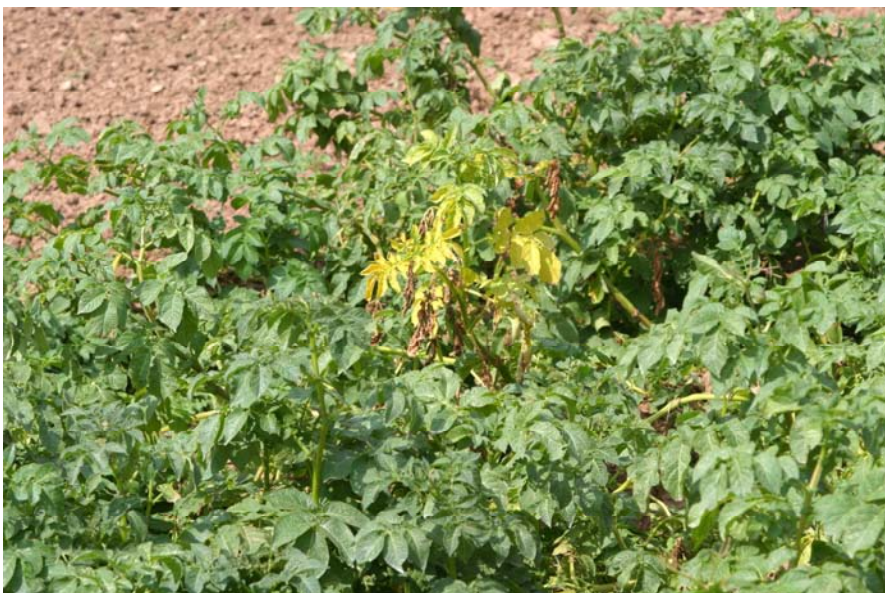
A plant with blight amongst healthy plants