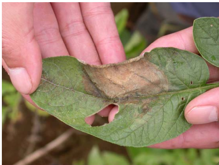
Fine, white downy growth on underside of leaflet